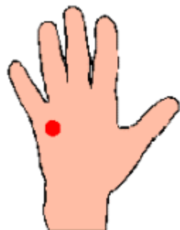
The Gamut Point